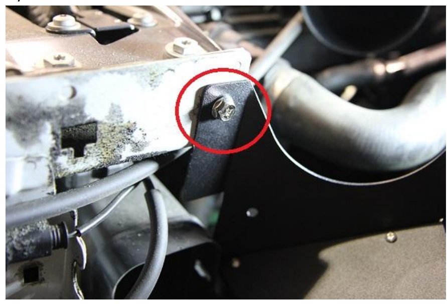
Step 7: Transfer the MAF sensor from factory intake to CTS MAF housing using T20 torx. Be careful when handling the sensor. Small amount of lubrication on the sensor o-ring will make the install easier.