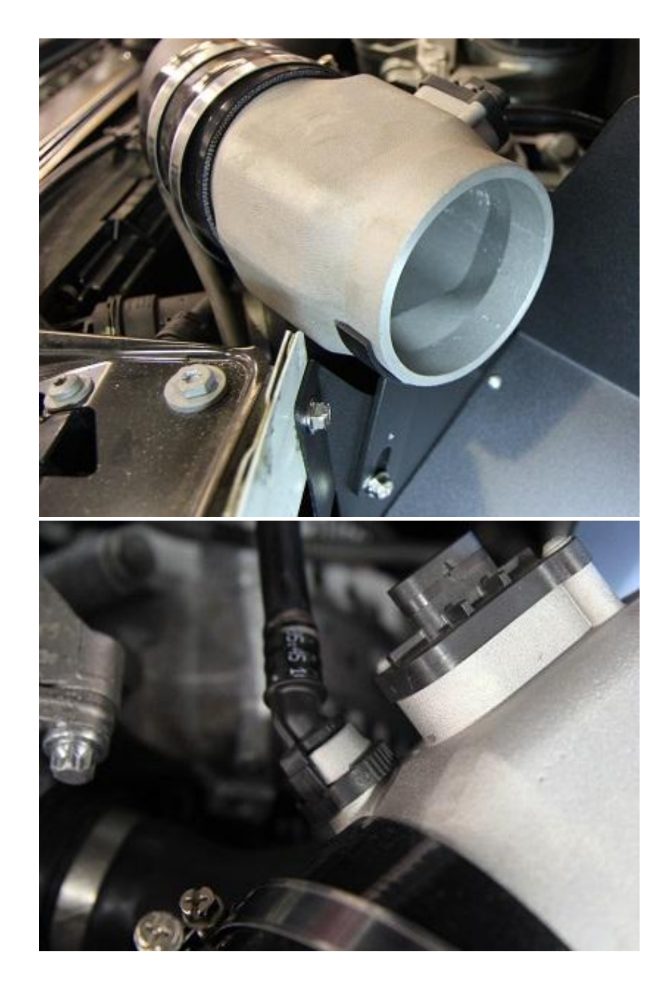
Step 9: Install the air filter – filter will rest on the support bracket and clamp will go around the support and filter securing both. Tighten all clamps (8 and 7mm) starting on filter side, work your way over to factory clamp, make sure you line up all the components as shown. Reconnect MAF harness. Start the car and let idle for 5-6 minutes. Test drive and you're done!