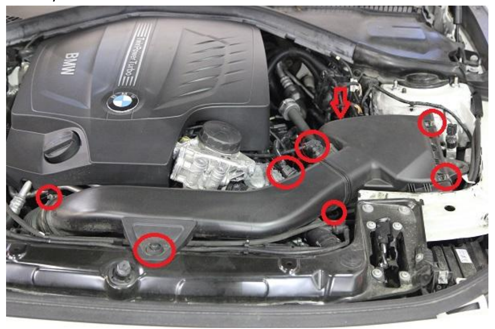
Step 1: Loosen factory clamp on the stock intake (7mm), unclip and remove breather line (if equipped) and MAF connector. Unclip 4 metal clips holding the airbox together. Remove factory intake tube.