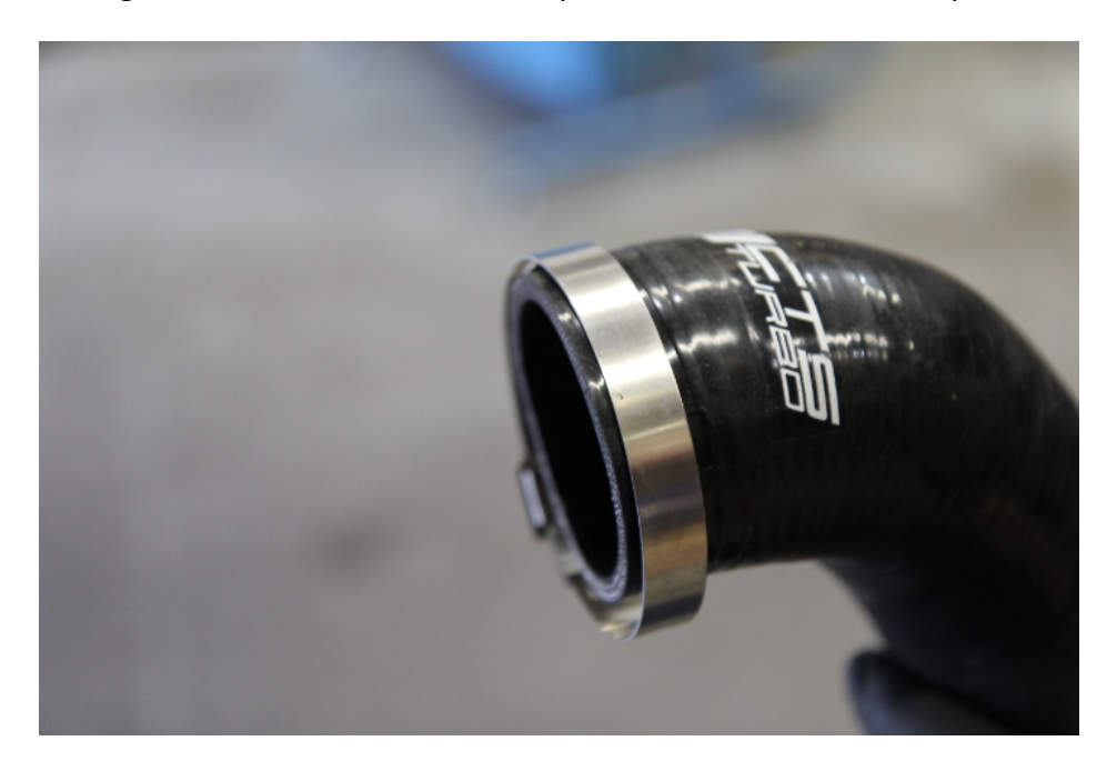
Step 7 : Manouver the new pipe into place slipping the silicon over the new billet turbo hose adaptor. Reinstall the 2 T30 torx bolts and tighten the clamps over the silicon.