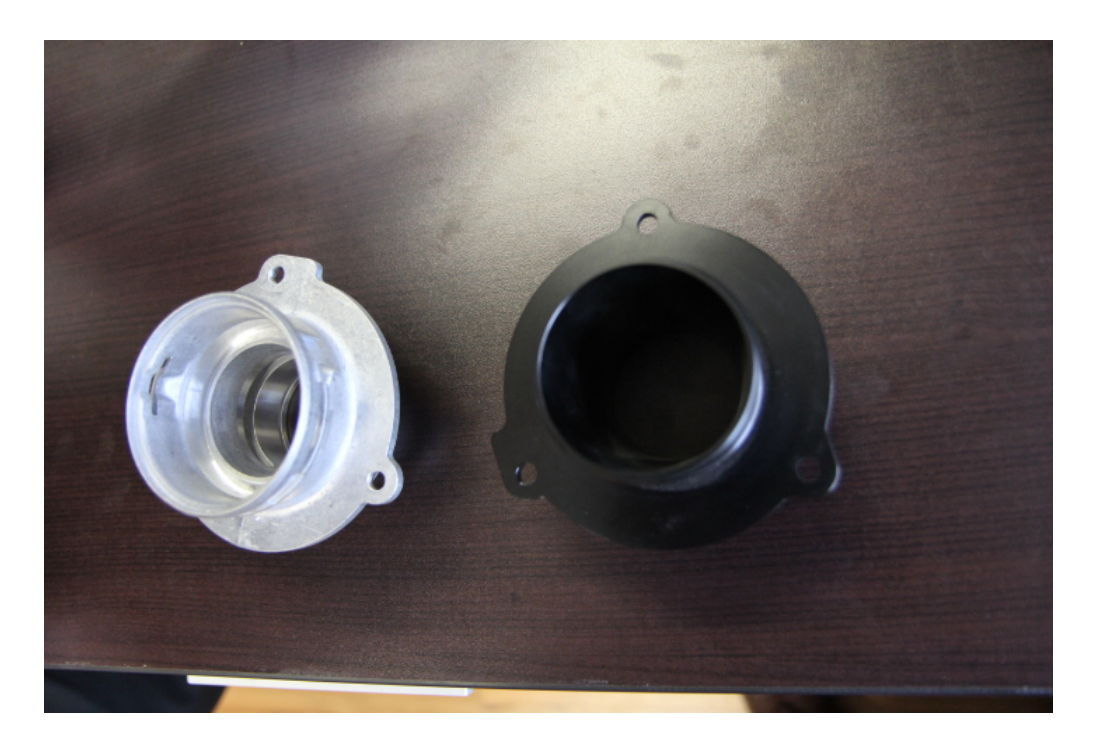
Step 5 : Replace the stock turbo hose adaptor with the supplied billet unit. Reuse the 3 oem bolts.