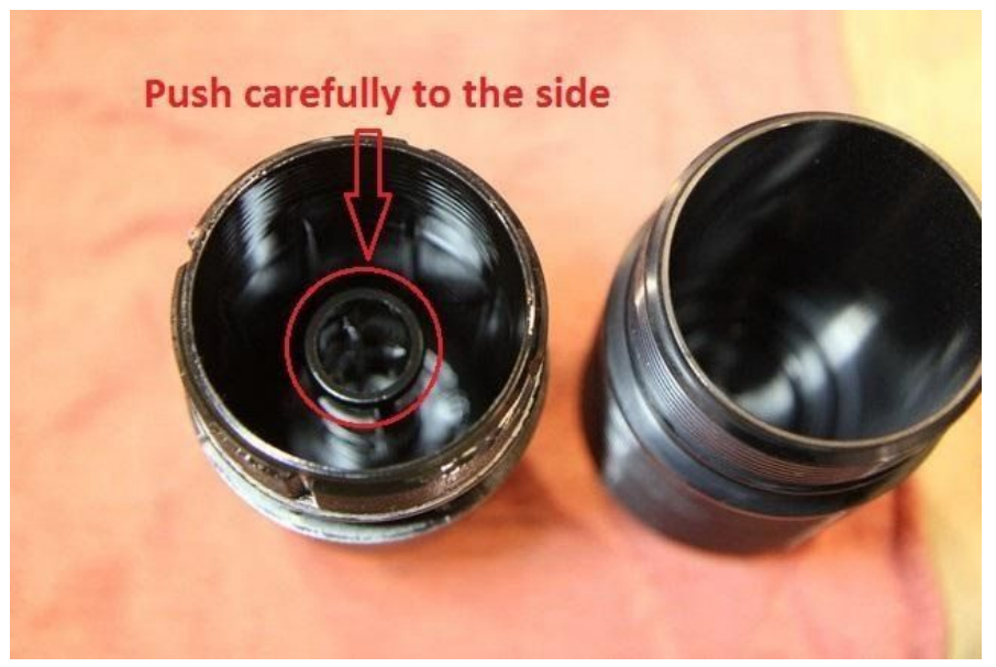
Carefully remove the filter cage by pushing it to the side of housing.